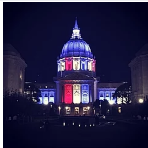
San Francisco City Hall illuminated in special red, white, and blue LED lighting at night on November 6, 2018 to commemorate Election Day all around the United States