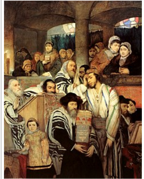
Jews Praying in the Synagogue on Yom Kippur , by Maurycy Gottlieb (1878)