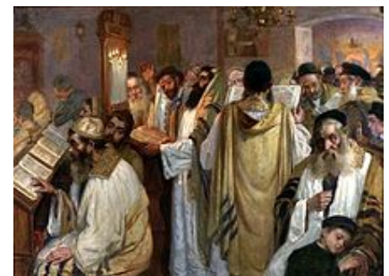
On the eve of Yom Kippur by Jakub Weinles

Leviticus 16:29 ( https://www.mechon-mamre.org/p/pt/pt0316.htm#29 ) mandates establishment of this holy day on the 10th day of the 7th month as the day of atonement for sins. It calls it the Sabbath of Sabbaths and a day upon which one must afflict one's soul.