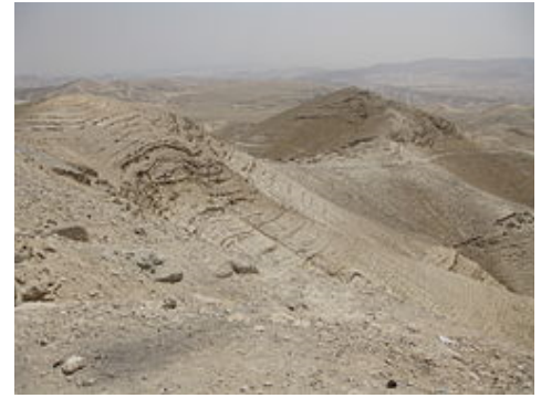
Cliffs of Mount Azazel

▪ Goat for Azazel The Kohen Gadol left the Haichal and walked to the east side of the Azarah (Israelite courtyard). Near the Nikanor Gate, he leaned his hands ( Semikha ) on the goat "for Azazel" and confessed the sins of the entire people of Israel. The people prostrated themselves when he pronounced the Tetragrammaton. While he made a general confession, individuals in the crowd at the Temple would confess privately. The Kohen Gadol then sent the goat off "to the wilderness". In practice, to prevent its return to human habitation, the goat was led to a cliff outside Jerusalem and pushed off its edge.