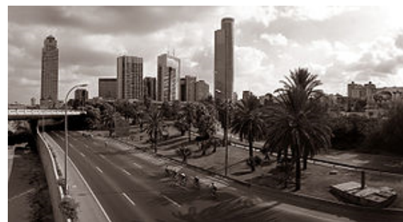
Ayalon Highway in Tel Aviv , empty of cars on Yom Kippur 2004

In 1973, an air raid siren was sounded on the afternoon of Yom Kippur and radio broadcasts were resumed to alert the public to the surprise attack on Israel by Egypt and Syria that launched the Yom Kippur War .